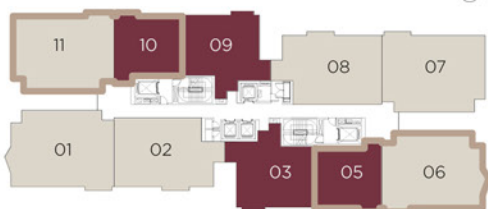
South Tower 1